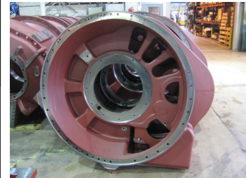
Housing for Wind Industry