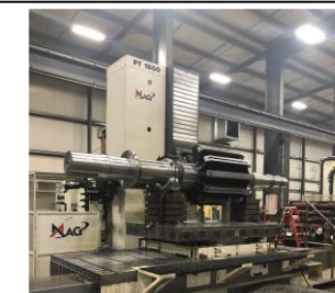
Rotor Shafts and Dovetails

DELIVERING RESULTS, RELIABILITY, AND ROCK-SOLID DEPENDABILITY. COMMITTED TO YOUR SUCCESS.