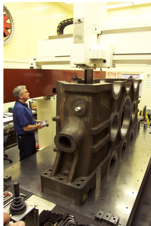
CMM Inspection of Middle Housing for Wind

Quality Assurance: Our electronic Business Process Manual (BPM) provides a structured method to our streamlined operations and enhanced efficiency. These techniques are used to identify, model, analyze, modify, improve, and standardize not just our manufacturing processes but all aspects of our business for collecting data and analytics.