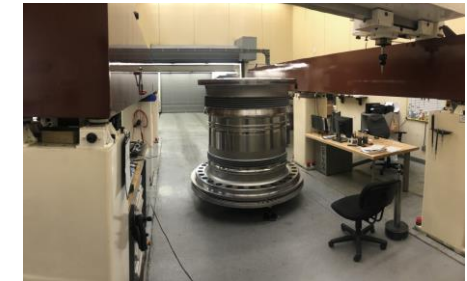
CMM Inspection of Turbine Rotor